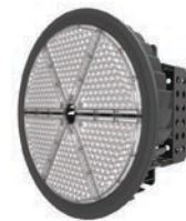
PIERLITE 600W HIGHBAY