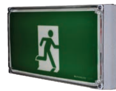
PIERLITE WARDEN 2 DALI INDUSTRIAL