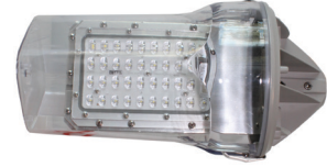
PIERLITE MINE MASTER