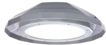
PIERLITE SATURN HIGHBAY