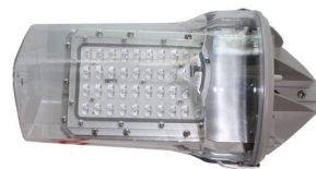
PIERLITE MINE MASTER