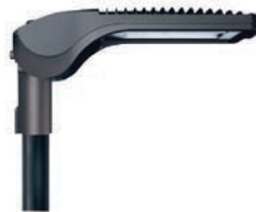
DISANO MINI STELVIO