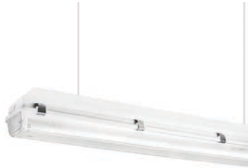
PIERLITE SDW LED 2