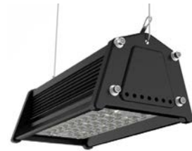
PIERLITE LINEAR HIGHBAY