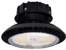
PIERLUX DALI HIGHBAY