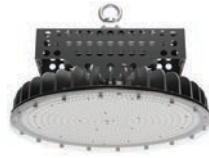
PIERLITE 420W HIGHBAY