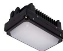
PIERLITE NEXUS GEN 2