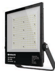
PIERLITE MAXI MASTER GEN II