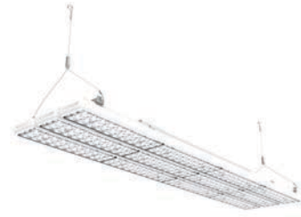
PIERLITE ARION RANGE