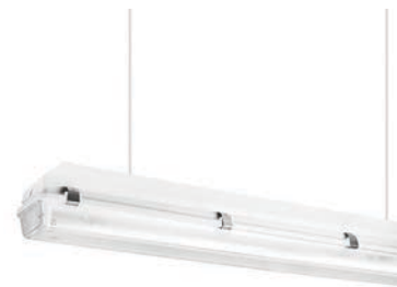
PIERLITE SDW LED