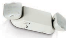
PIERLITE GUARDIAN 2 DALI