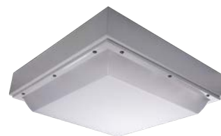
PIERLITE STELLAR GEN 2