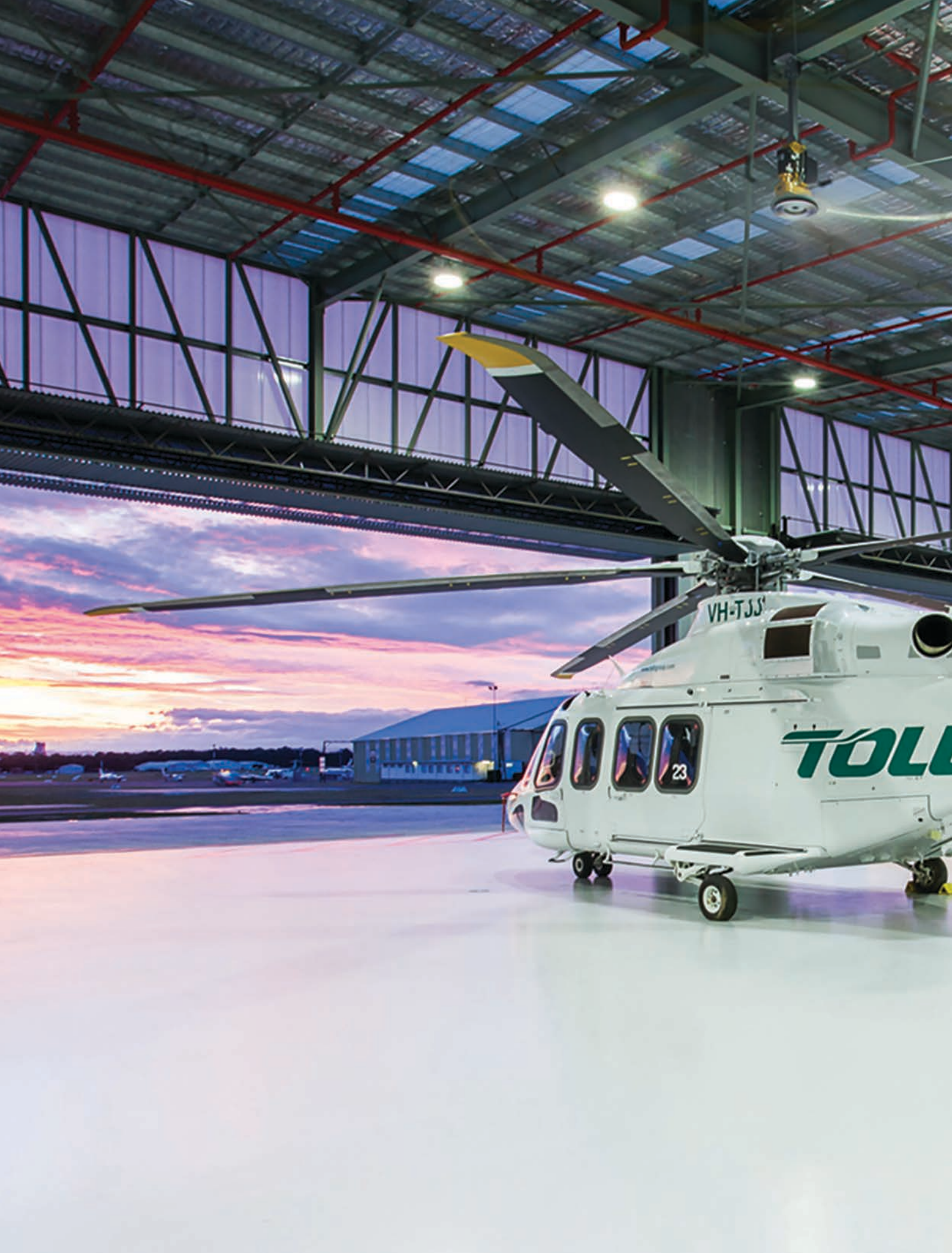
BANKSTOWN AIRPORT TRAINING CENTRE