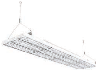
PIERLITE ARION RANGE