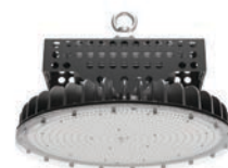
PIERLITE 420W HIGHBAY