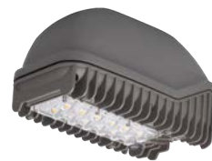
PIERLITE ALIEN GEN 2

Putting safety at the forefront, each Pierlite solution exceeds Australian standards to ensure optimal performance in day-to-day operations.