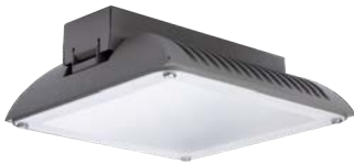
PERLITE C350 GEN 2