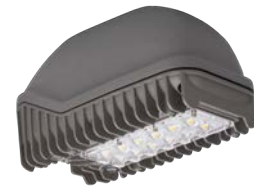
PIERLITE ALIEN GEN 2